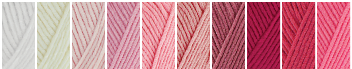
310 White 326 Ivory 203 Light Pink 226 Rose 229 Flamingo Pink 225 Vintage Pink 228 Raspberry 238 Deep Fuchsia 237 Fuchsia 242 Pink Lemonade