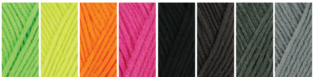
1547 Neon Green 1645 Neon Yellow 1693 Neon Orange 1786 Neon Pink 325 Black 2237 Charcoal 2238 Antracite 2235 Ash