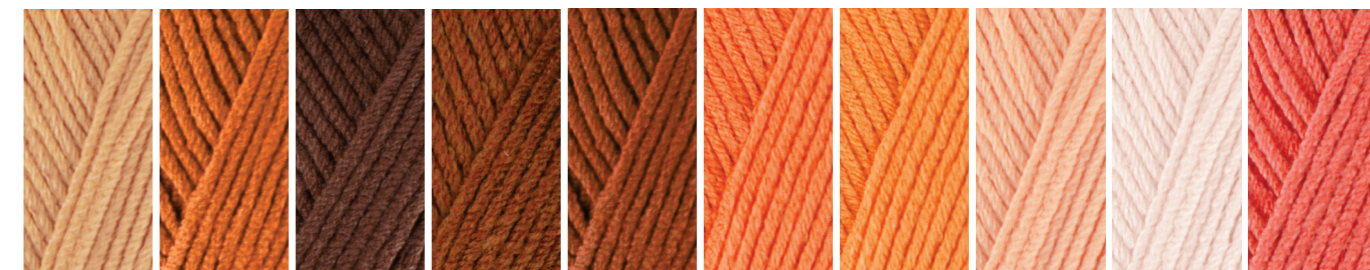
2209 Camel 2210 Caramel 385 Coffee 2214 Cayenne 2239 Brick 2194 Orange 2197 Mandarin 211 Peach 2192 Pale Pink 2190 Coral