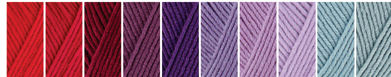
318 Tomato 317 Deep Red 222 Bordeaux 249 Plum 272 Violet 269 Light Purple 396 Lavender 268 Pastel Lilac 2124 Baby Blue 289 Blue Grey