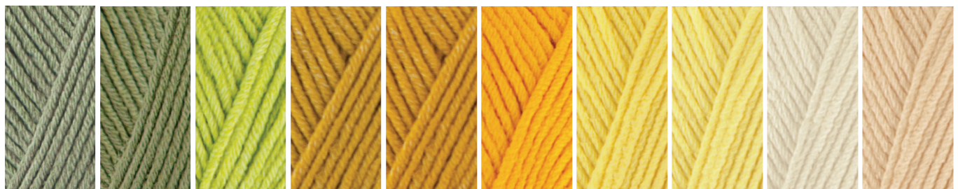
402 Seagrass 2168 Khaki 352 Lime 2182 Ochre 2211 Curry 2179 Honey 2180 Bright Yellow 309 Light Yellow 2172 Cream 2208 Sand