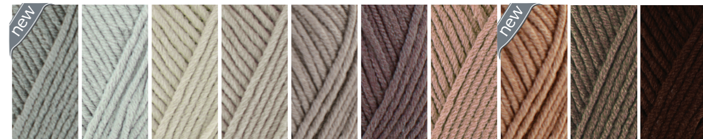
new 2233 Mouse Grey 2228 Silver Grey 2212 Linen 341 Pebble 343 Warm Taupe 342 Teddy 2223 Liver new 2218 Hazelnut 344 Walnut 2230 Dark Brown