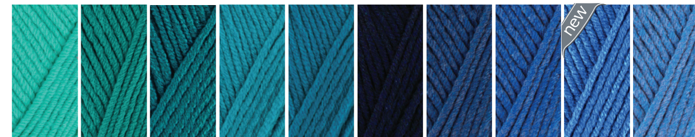
2138 Pacific Green 2140 Tropical Green 2142 Teal 371 Turquoise 375 Petrol 321 Navy 370 Jeans 2103 Cobalt 2106 Peacock Blue new 295 Ocean